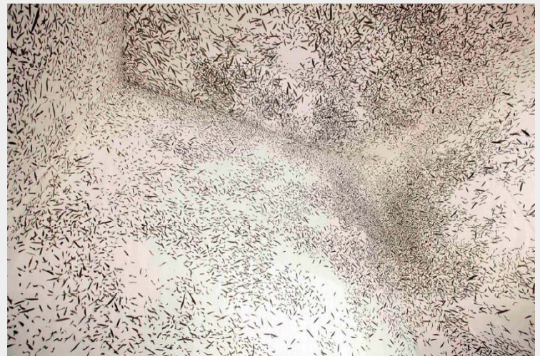
Don’t They Ever Stop Migrating? 2015, ink on fabric site-specific installation with sound at Oratorio di San Ludovico, Nuova Icona, Venice, Italy

Mirroring Venice’s history as a place of cultural collision and of departure and arrival, the installation offered a powerful reflection on the global migration crises with particular reference to the Mediterranean Sea and Bay of Bengal. A white three-dimensional painting, broken up by hundreds of thousands of black ink brushstrokes, the painting covered the interior structure of the Oratorio. Viewer experience was heightened by a chorus of incoherent English words and abstracted human voices, interrupted by silences. In this immersive environment, Yu forced her audience to confront individual prejudices and core beliefs about who constitutes “the other,” in a poignant and powerful meditation on the crises of global migration.