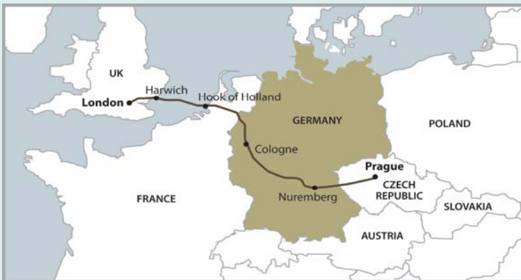
Map: Route of the Winton Train from Prague to London.

Miracles and mysteries, like missed boats and chance meetings, random events that determine our very existence. What might have been had my mother not fled Czechoslovakia in 1939 or my father not returned from his posting in India in 1945? What if the music that wafted upstairs to the library at Toronto's Newman Centre had not been so captivating as to distract my mother to descend the stairs to the small group gathered below? My parents, both immigrants to Canada, who met on that rainy night in Toronto brought together by the music of Mozart, were married in 1956 and had five children, all girls.