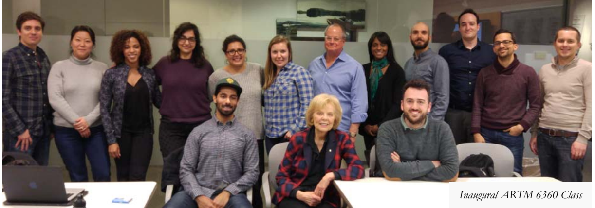
Inaugural ARTM 6360 Class

And so it came to be that ARTM 6360 met for the first time at 6:30 p.m. on January 13, 2016. Over the next 12 weeks, we explored Rogers' NHL digital strategies, Ubisoft's human resources policies, Warner's music, Bellmedia's OTT service, revenue models from venture capital to crowd funding; strategic planning for a digital amusement park. We debated what makes a video game Canadian,