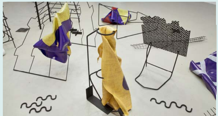
how do you surrender to a drone? (installation detail), 2015. Gales Gallery, York University

In the spring of 2016 (March 22 - April 30, 2016), Collyer's work was featured in an expanded exhibition at Toronto's YYZ Artists' Outlet. The exhibition was supported by the Ontario Arts Council and Gallery 44.